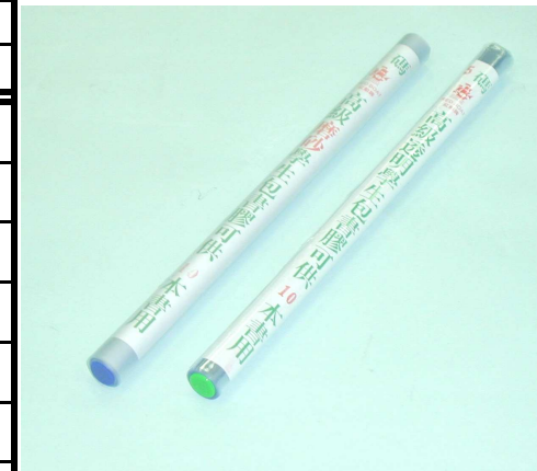
( Roll )